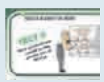
Health & Safety

Remember: We can run all our trainer courses in-house anywhere in the UK or Worldwide, with group discounts available. We also develop and present bespoke trainer packages.